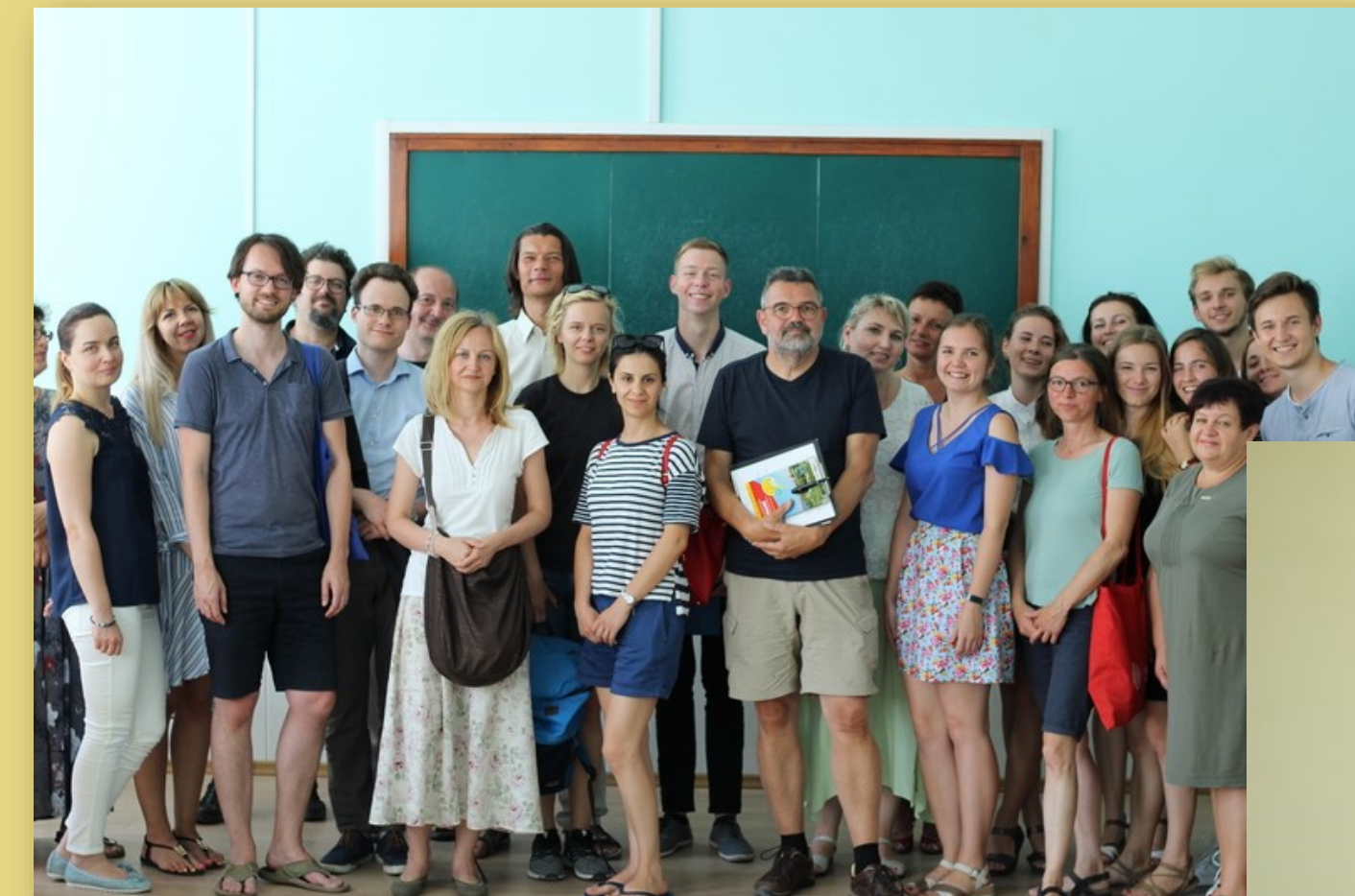
Teachers and PhD students delegation of Leipzig University in BSPU