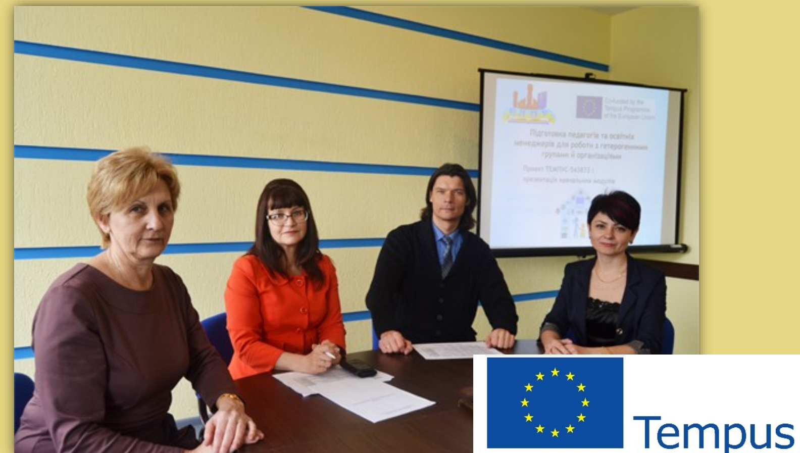
TEMPUS project team of Berdyansk State Pedagogical University