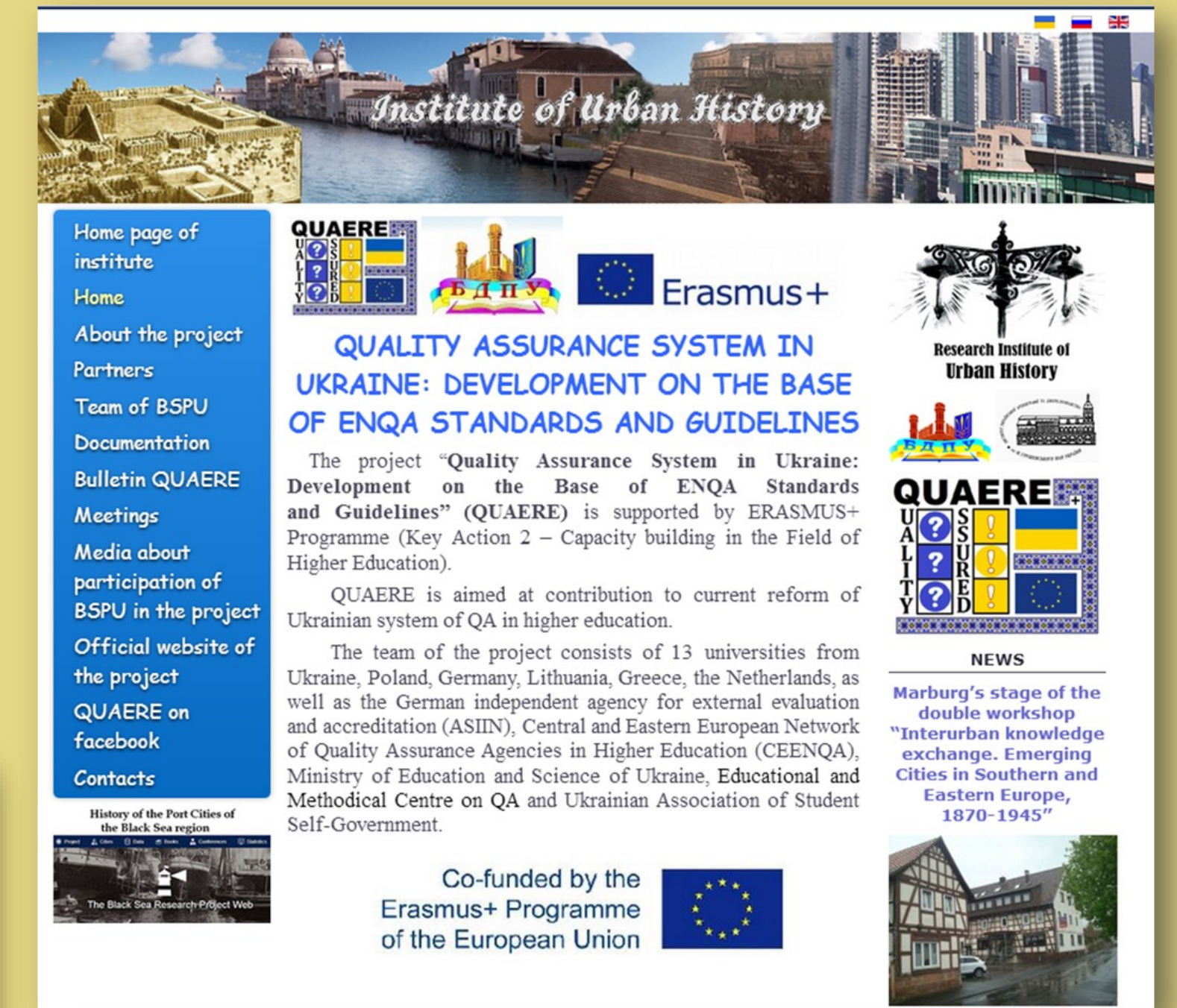
Website of Erasmus+ project (QAERE)