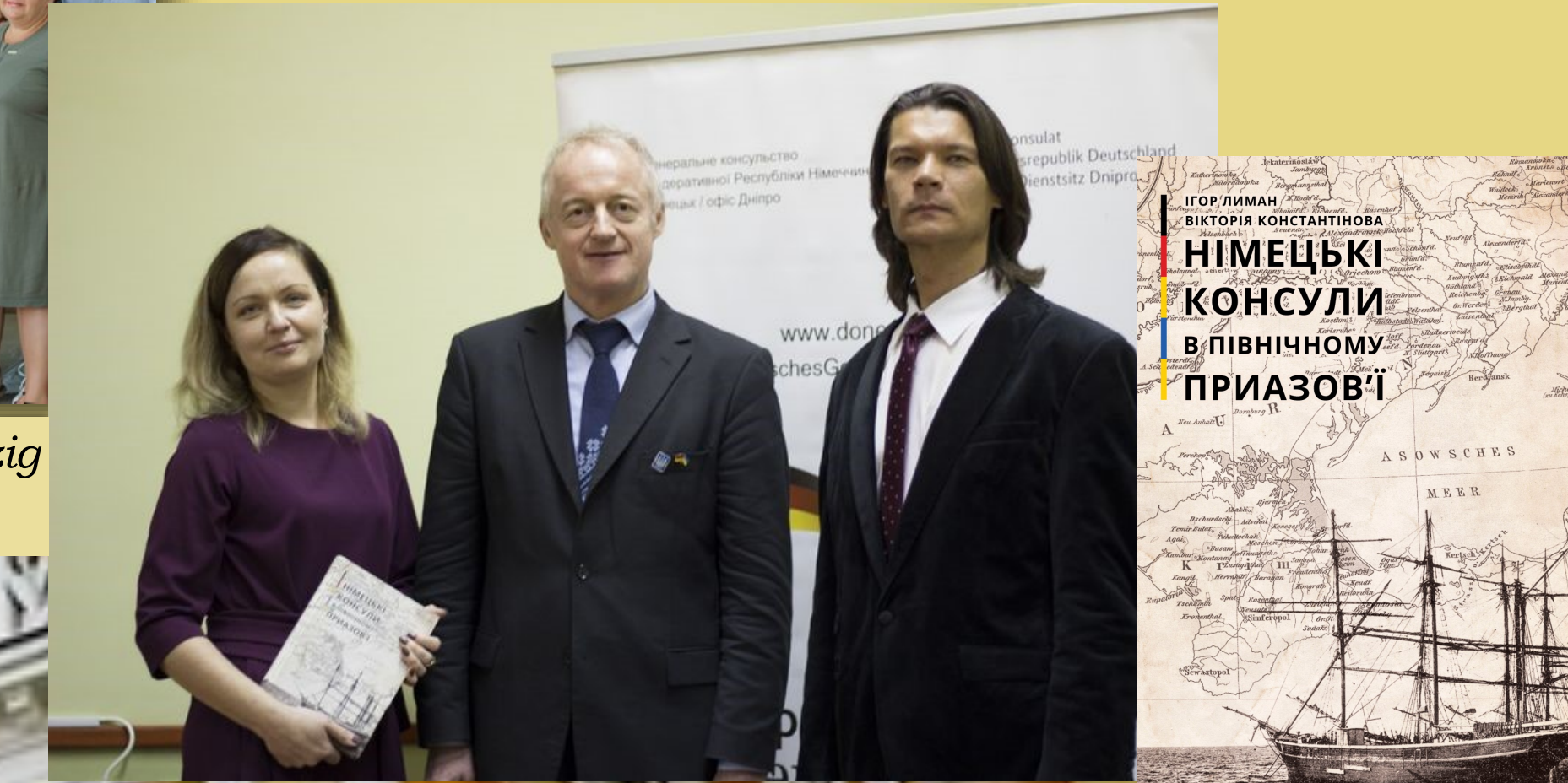
Presentation of the monograph "German Consuls in the Northern Azov Region" organized by the Consulate General of Germany in BSPU